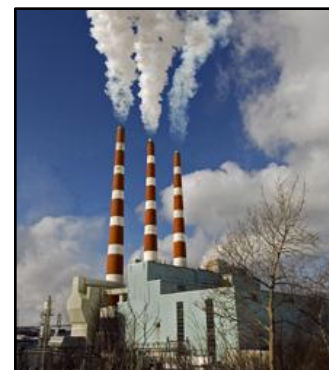
Nova Scotia Power's Tuft's Cove Generating Station

University of Alberta's Dr. Andre Plourde states that a general rule of thumb for savings is 5.4% per degree Celsius of adjustment. 8 Although estimates are conservative, 9 this report uses the same figure: 5.4% for a 1°C change. Illustrating that savings can exceed 5.4%, I used Honeywell's calculator for commercial energy savings 10 and found the annual energy savings to be 7.0% by adjusting a 50,000 square foot retail building's temperature by 1°C closer to the outside temperature all year. 11